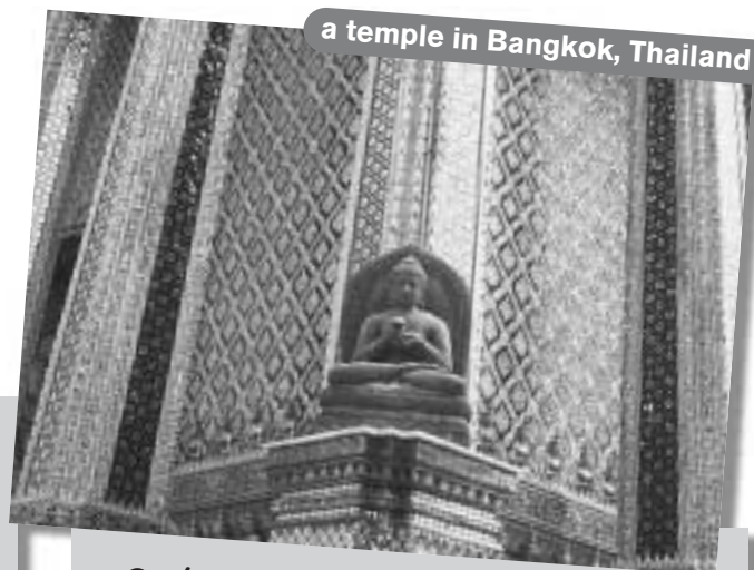
a temple in Bangkok, Thailand